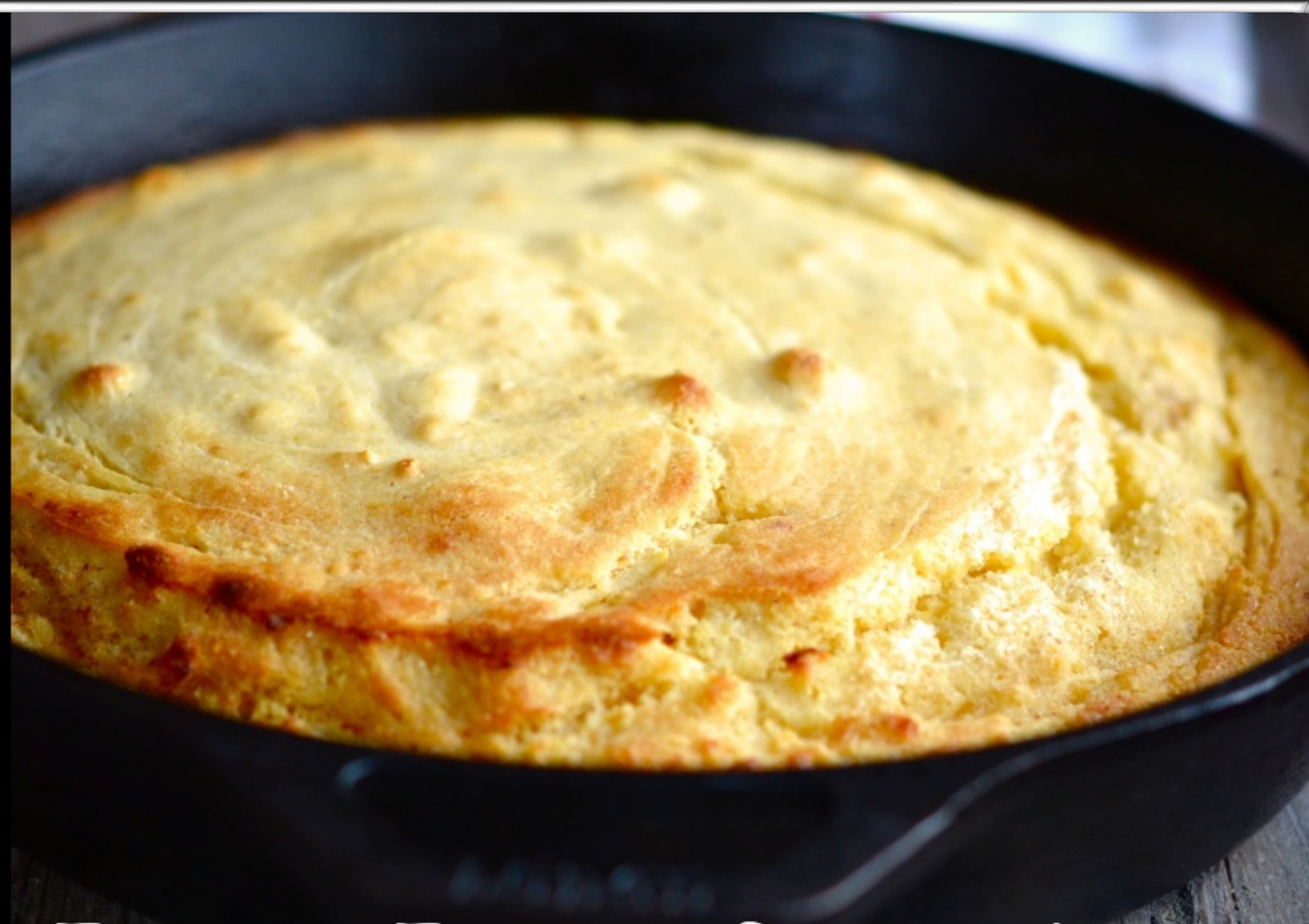
Brown Butter Cornbread